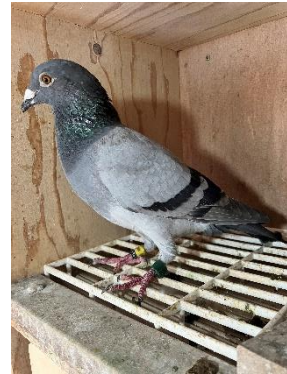
Nic's 3 rd Arrival