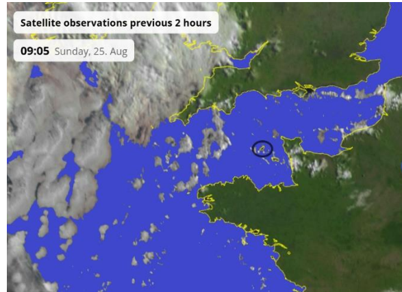
Satellite image of Guernsey

This report is based on member's first bird verifications and the final result may differ.