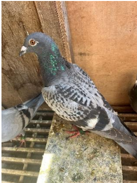
Nic's 1 st arrival

3 rd South Centre Section, 7 th Open was Ken Wise of Isleworth over 166 miles on 1863. Ken timed GB24N00303 at 10.37 to take 3 rd section.