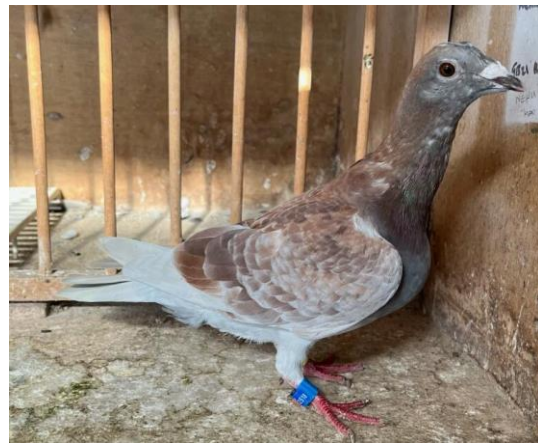
Brian Pearce's red chequer cock bird