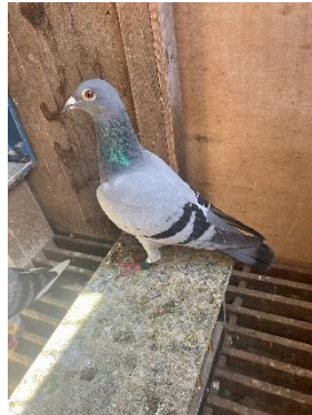
Nic's 2 nd Arrival