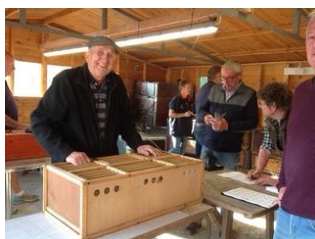
Marking facilities at Bamfords