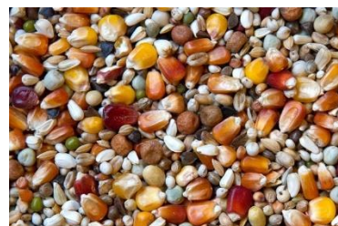
The Red Rosette mixture