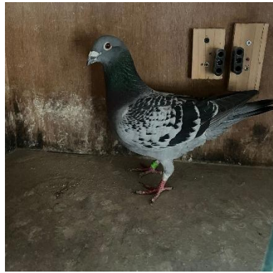
M Connolly's chequer cock bird