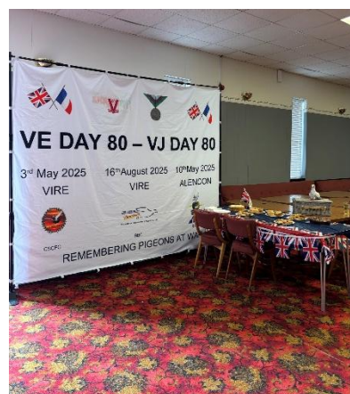
Tea Party celebrations