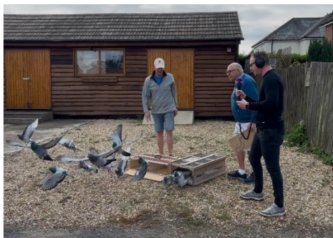
The Radio Solent interviewer