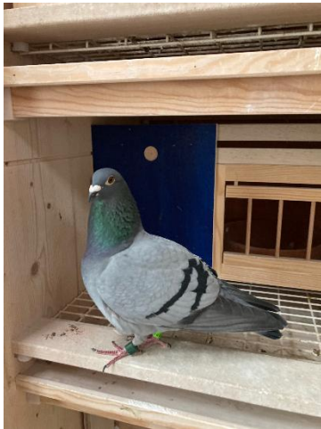
G Treharne & Son's blue hen