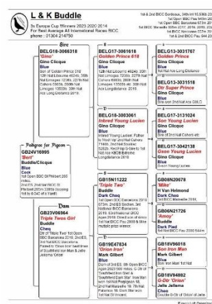
Pedigree of winning bird