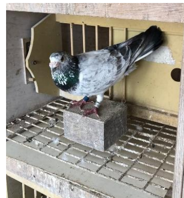
Nigel Legg's cock bird