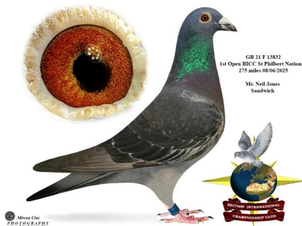
The BICC winner

and the conveying team got it right. Many thanks to them and thanks also to the Gravesend marking team.